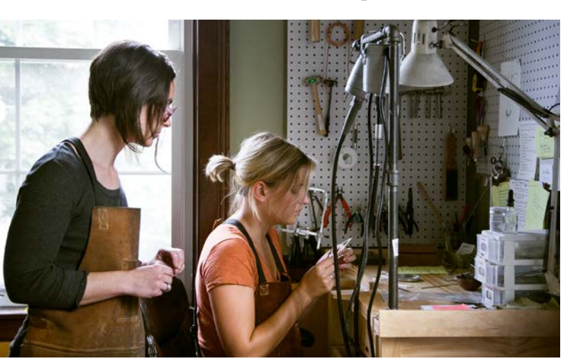
The Commission is proud to partner with the Maine Craft Association to launch the state's first Craft Apprenticeship Program in 2016. Apprenticeship programs help boost local economies by acting as a new kind of job and career training.

How will we collect your information? Throughout 2016, we will be asking all of the state's 501c3 nonprofit organizations for detailed financial data. Whether you are part of a theater or dance company, a museum, an arts education organization or even a seasonal festival we will ask you to complete detailed survey info.