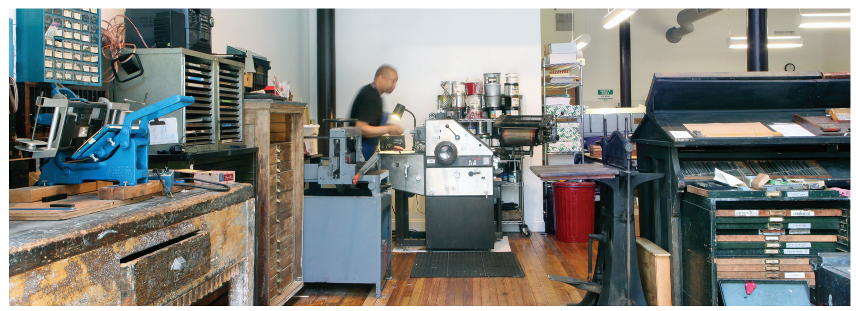
AS220 Mercantile Printshop, Providence, RI