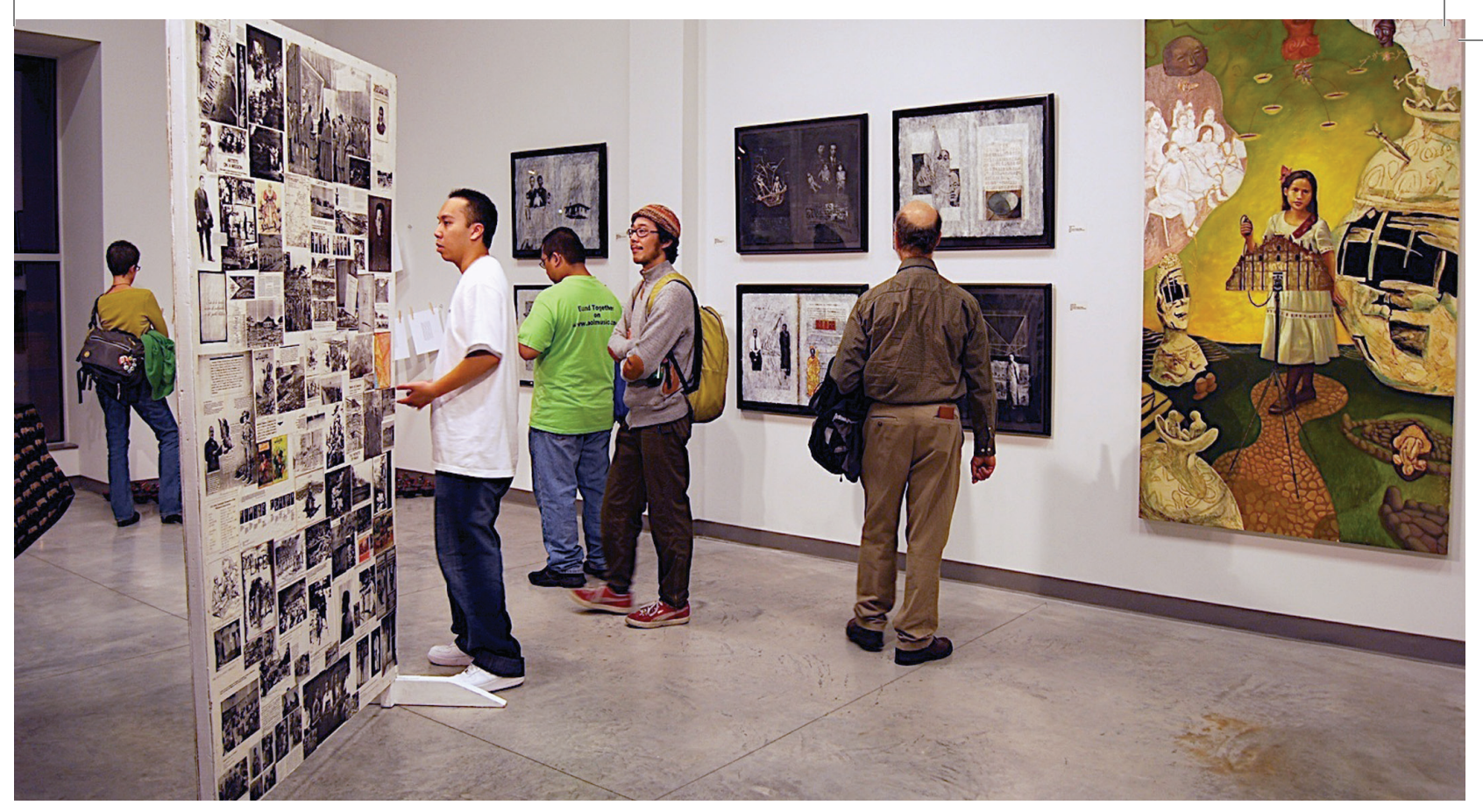
Asian Arts Initiative Gallery Exhibition, Philadelphia, PA