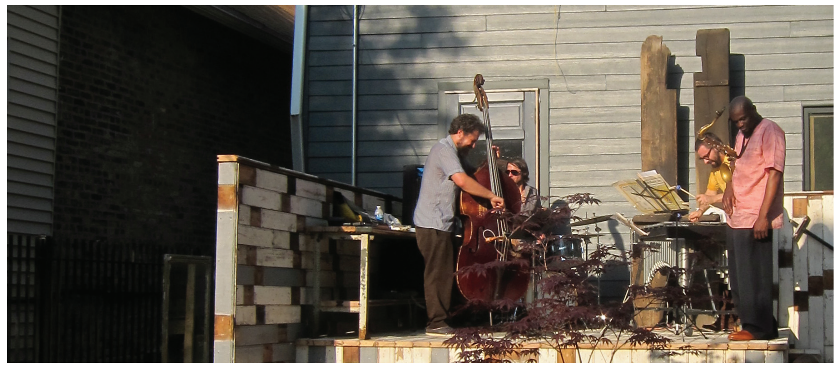
Band Setting Up, Dorchester Projects, Chicago, IL

When planning for robust cultural vitality, urban planners and policymakers should consider art space options beyond those with which they often are most familiar. To be fair, even with the limited categories that are most typical—large presenting venues, cultural districts, and artist live/work spaces—some recent developments related to these concepts are worth noting. For example, as stated earlier, several large presenting venues are considering how they might work more proactively and effectively with community-based arts organizations and how they might address demand for other kinds of cultural participation beyond audience participation. Some performing arts presenters recognize that traditional presentation venues are insufficient to address both the demand for audiences' increasing interest in more active cultural engagement