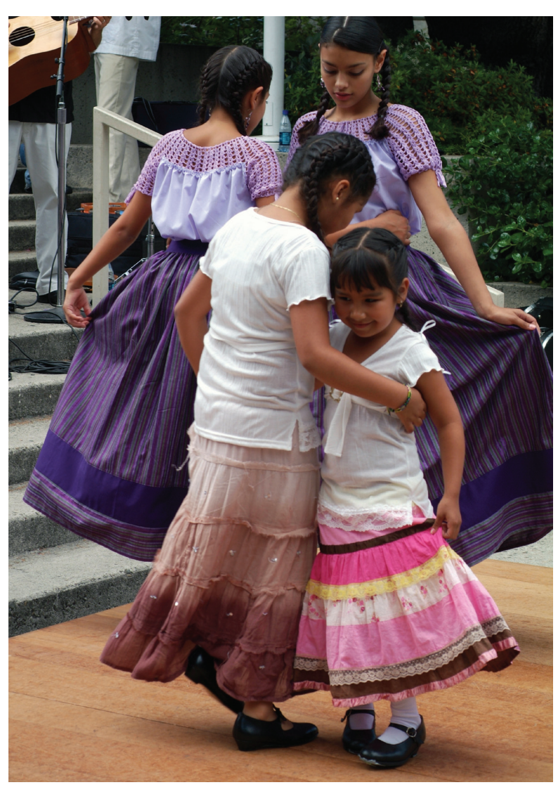
Girls on Tarima, Los Cenzontles Mexican Arts Center, San Pablo, CA

In addition to considering conventional venues and activities related to the presentation of professional art for consumption, it is necessary to think about a broader range of activities and places implicated in the concept of cultural vitality . <sup>5</sup> A place with cultural vitality has a character and identity based on the creative and artistic contributions and aspirations of its citizenry. Research has linked dimensions of cultural vitality to economic development, attachment to place, positive health outcomes, and civic engagement, among other desirable effects. Based on our years of study and that of others, we recommend that planners and policymakers heed the following premises in planning for cultural vitality and making the most of community revitalization strategies. <sup>6</sup>