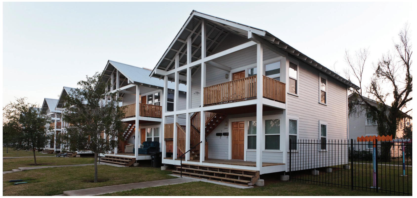
Francis St. Rice University Collaboration, Project Row Houses, Houston, TX